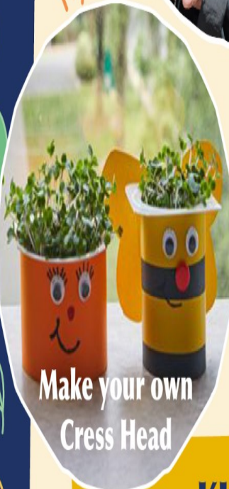
Make your own Cress Head