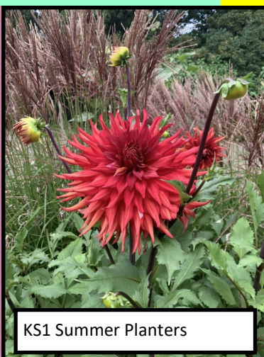
KS1 Summer Planters