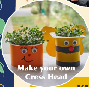
Make your own Cress Head